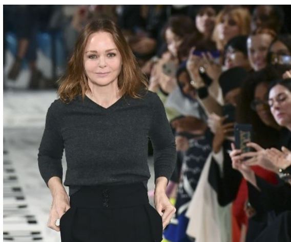
Stella McCartney started her career as a Tailor Apprentice