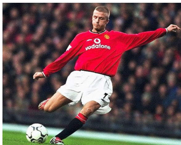
David Beckham started his career in the football Youth Training Scheme