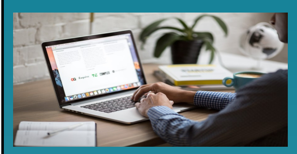
Teaching and Learning