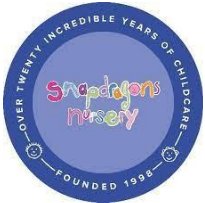
Early Years - Level 3

Click the logos below for more information about these apprenticeship opportunities: