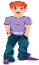
Illustration of a young boy in a purple shirt and blue pants.