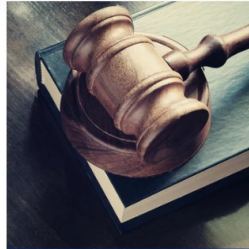
Young Lawyer Summer Experience