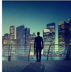
Young Entrepreneur Summer Experience