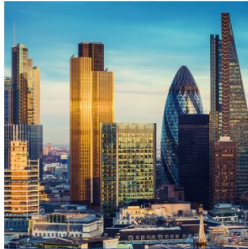
Young Investment Banker Summer Experience