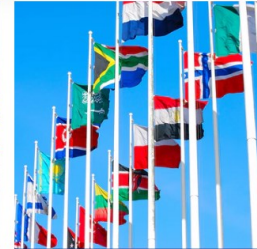
Young Political Leader Summer Experience